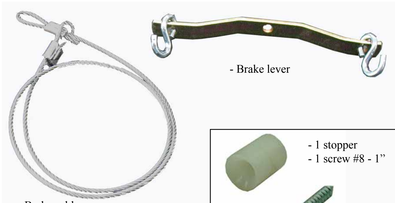
- Brake cable