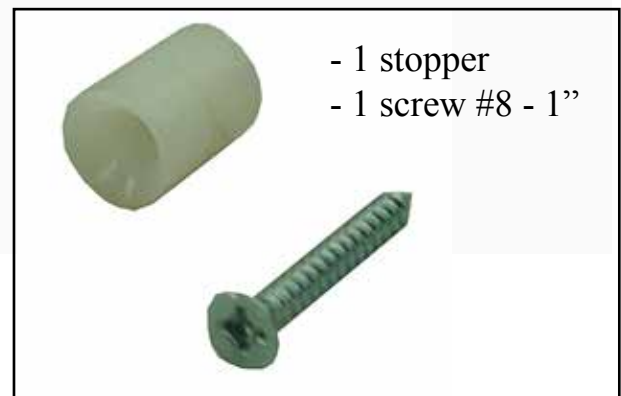
- 1 stopper - 1 screw #8 - 1"